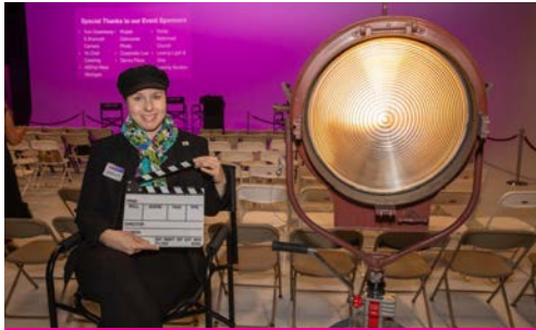
Starring Role - $10,000