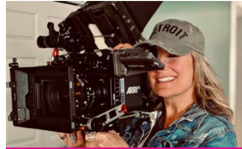
Director - $2,500