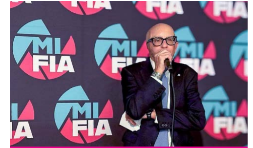
Writer - $1,000