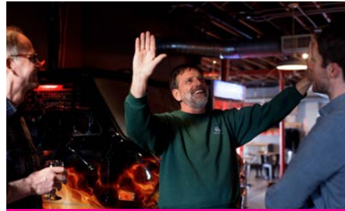
Producer - $5,000